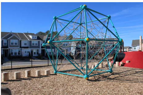
New park: Lunar Landing

Wake County is working on site design plans for Lake Myra County Park, which is situated adjacent to Wendell Falls in the Marks Creek watershed. You can view maps here , or join the next community meeting at Wendell Town Hall on February 13th to share your thoughts on the park.