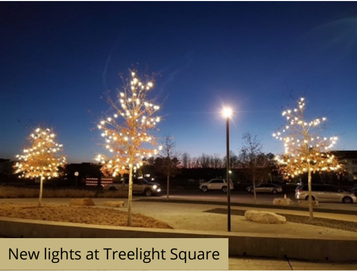
New lights at Treelight Square