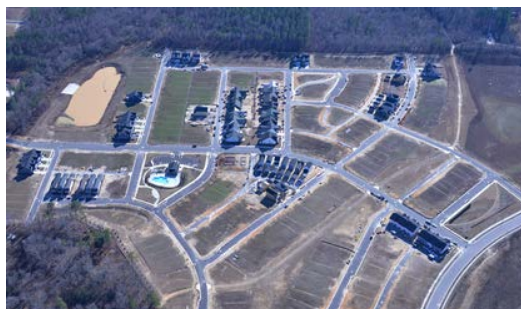
Homebuilding in Phase 10