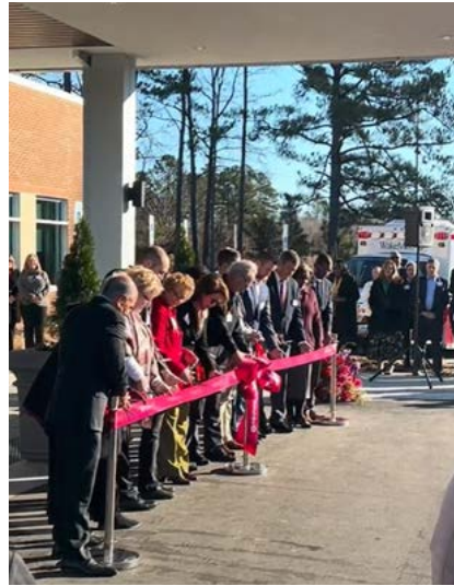
WakeMed Ribbon Cutting