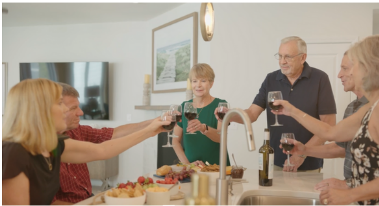
Residents at Encore participated in a promo video for David Weekley Homes, which will be used nationwide. View the full video here.