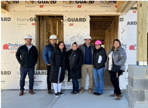
The Brookfield Residential team begins construction on model home

A new homebuilder is joining our award-winning lineup! Brookfield Residential has more than 65 years of homebuilding experience, and will be offering single-family homes at Wendell Falls. Their model home is underway in the new model park area (near Garman's Comfort model in Phase 12) and they anticipate to be open for tours around March. Their initial homesites, located in Phase 10B, will start construction soon. To learn more or sign up for updates, click here .