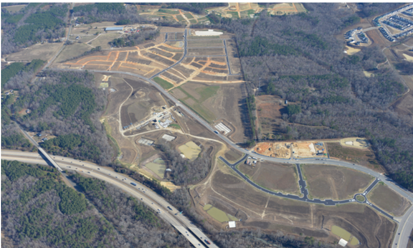
Development progress on Phases 10, 11 & The Collective

Materials have been ordered for the northern trail connection to the pedestrian underpass tunnel beneath WF Pkwy. Sitework will commence in late January with anticipated completion by spring.