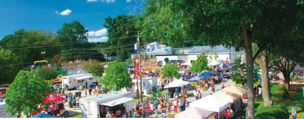
Downtown Wendell hosts numerous family-friendly events throughout the year.