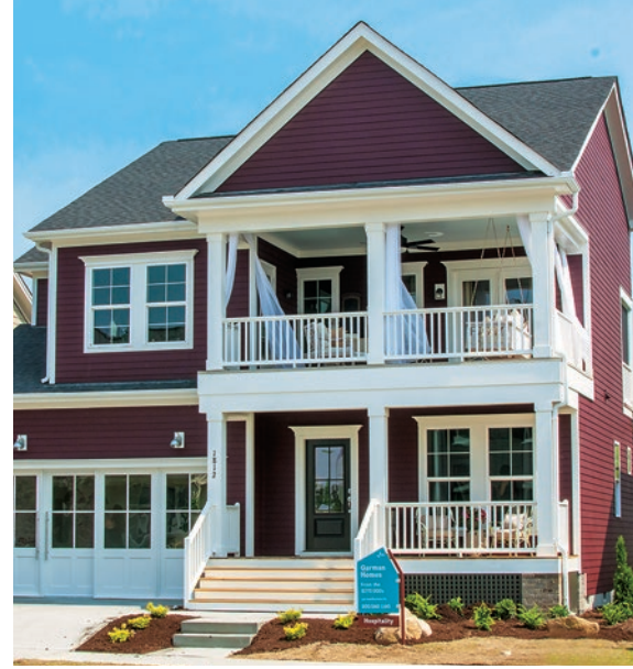
Wendell Falls is an 1,100+ acre mixed use development just minutes from downtown Raleigh.